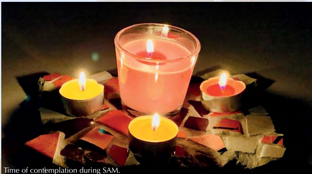
Time of contemplation during SAM.

It’s actually so funny how I got trapped into this kind of praying atmosphere, trapped in a positive way, because back home in Indonesia, I really didn’t have such intimacy with God - unless when was asked to play the piano. Then I would always be present, because I love it. But when it comes to bible study, most of the time I escape, because I preferred other stuff like going out with friends. However I loved worship, but I didn’t enjoy it that much as here in Himmels-