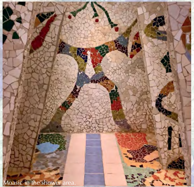
Mosaic in the shower area.