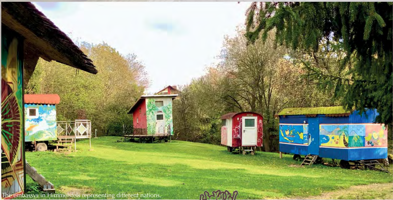
The embassys in Himmelsfels representing different nations.