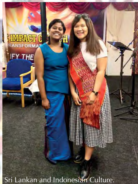
Sri Lankan and Indonesian Culture.