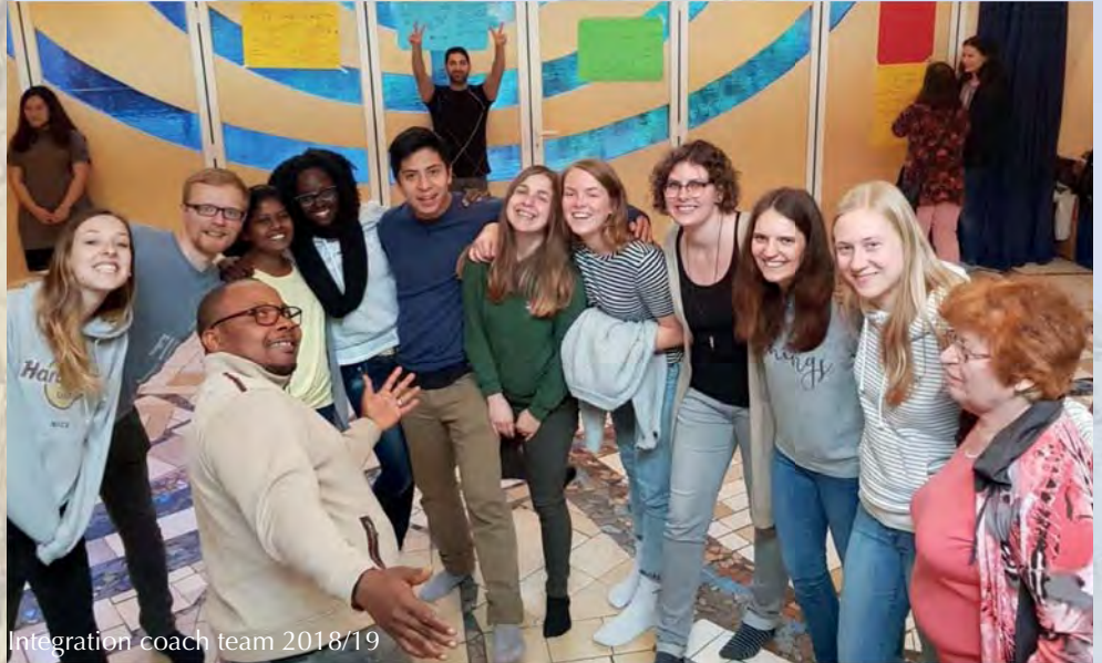
Integration coach team 2018/19

With the knowledge I obtained from the integration coach, I would describe this class as an opening to ones life calling or purpose. We come from different nationalities with different perceptions about almost everything. For example culture, religion, women emancipation, work, even just by how one says certain words can define something and mean a lot more than you in your own culture would ever imagine. The integration coach lessons are more of practical which is fun because some of us have to fight with what you might call small or minor battles - like fear to speak out, language barrier, and much more. However in these lessons, it's way fun than any best class that you ever attended while back in your country