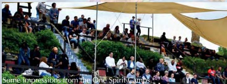
Some impressions from the One Spirit Camps.