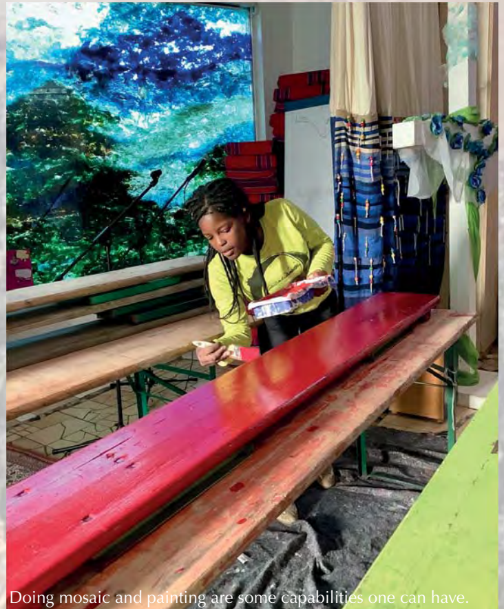
Doing mosaic and painting are some capabilities one can have.