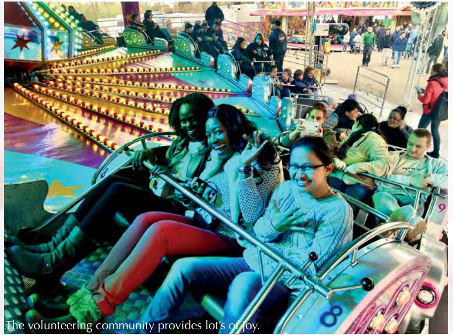
The volunteering community provides lot's of joy.